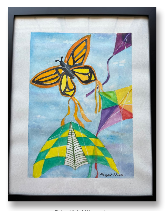
Flying High | Watercolor — Margaret Platte RSM