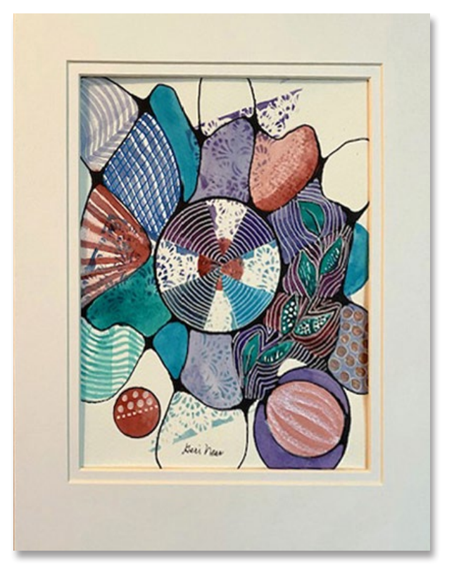
Wandering of the mind -Geri Near