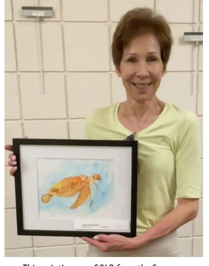
This painting was SOLD from the Summer show as we we putting up the Fall show!