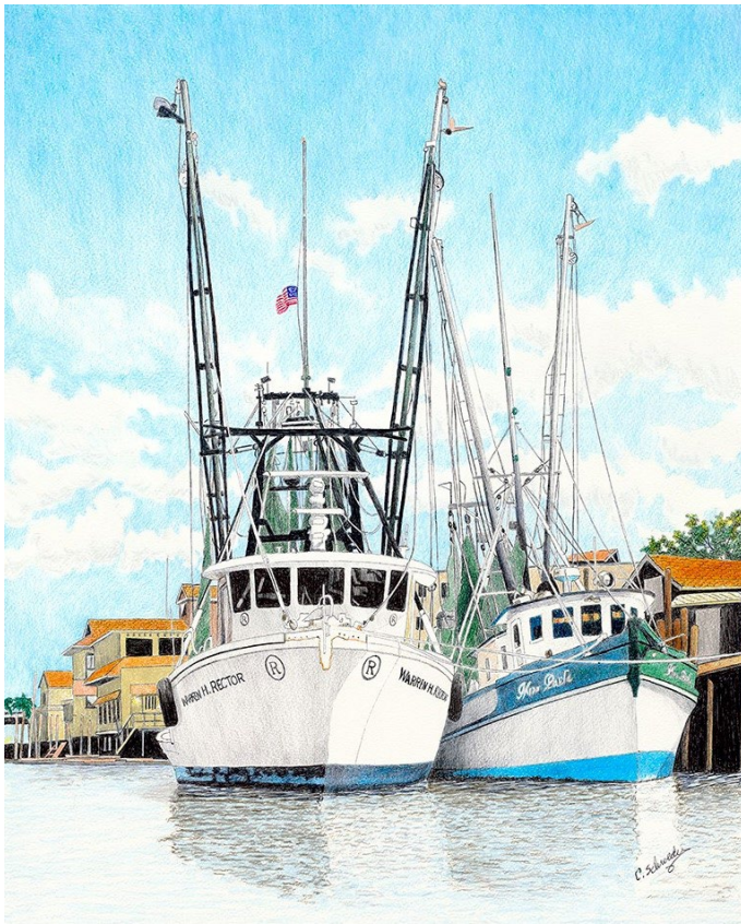
Chuck Schroeder was awarded Second Place in the Three Cities Art Club Spring Exhibition for Shrimp Boats . (Color pencil and pen)